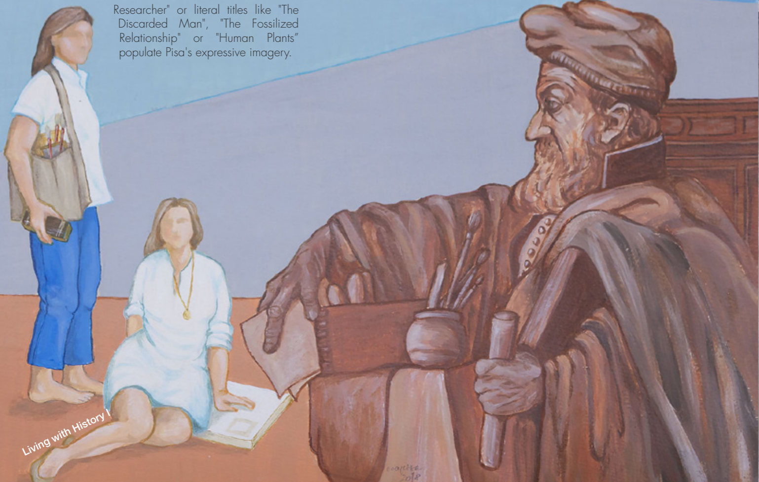
Living with History I