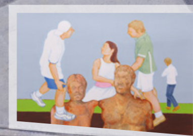
Living with History II